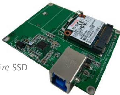
U213A + Half Size SSD