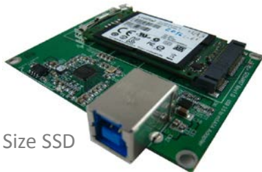
U213A + Full Size SSD