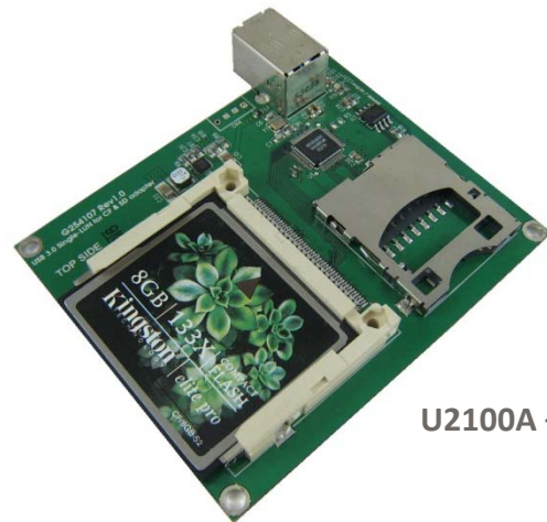
U2100A + CF Card